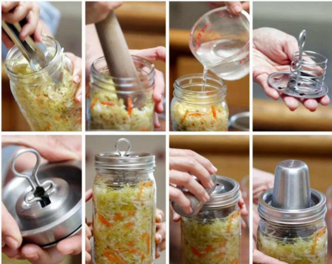
Cultured Gourmet's Kraut Source

A vision statement is more important than your mission. You need to know where you want to go with your idea. Make your vision statement the business you want to grow into. It's the dream you're going after. What does it look like? Can you clearly describe it to others?