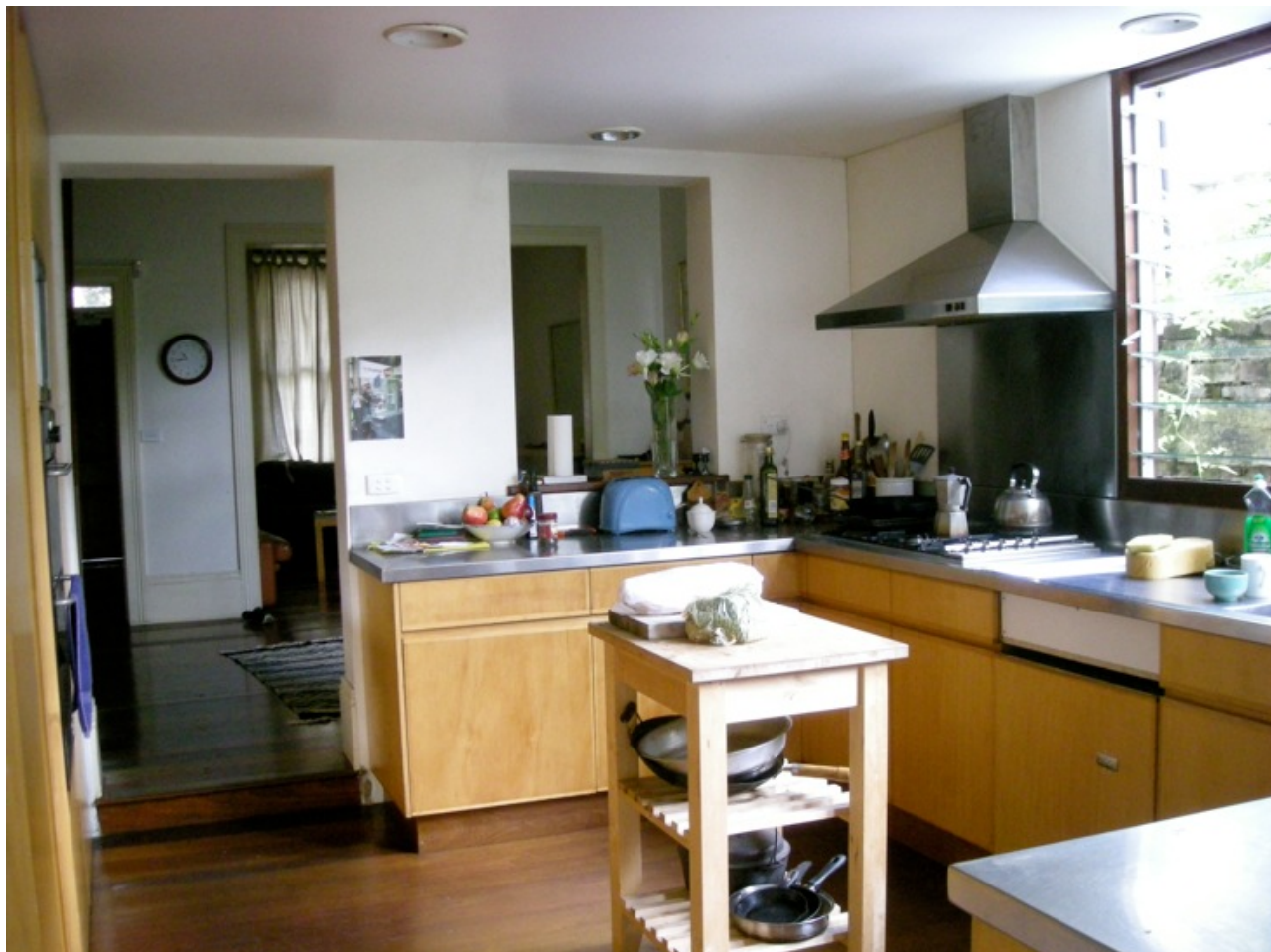
Michael Mobbs Sustainable House

2. Paint interior walls shades of white. This also applies to outdoor areas, such as fences. White reflects light back into your rooms. Avoid dark carpet, walls or furniture. Black eats light while pale colors bounce it around.